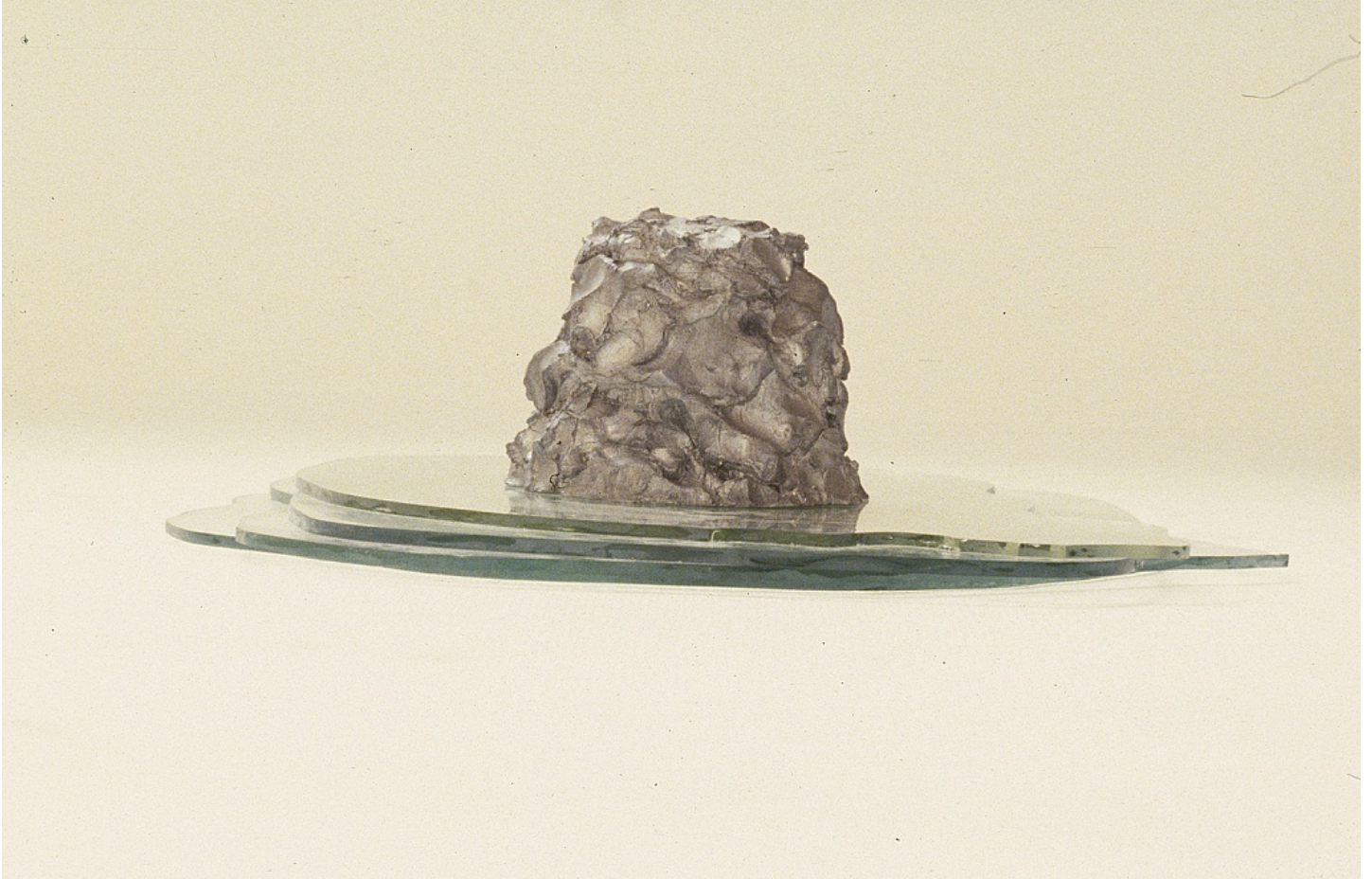
Øivind Nygård Monument for øjeblikkets tid, VI , 1984. Exhibited at "Gud og Grammatik" at Charlottenborg in 1984 Led and glass 60h x 70w x 30d cm DKK 40,000.00